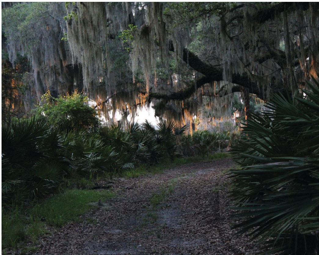
Blackbeard Island, located off the coast of Georgia, is a national wildlife refuge.